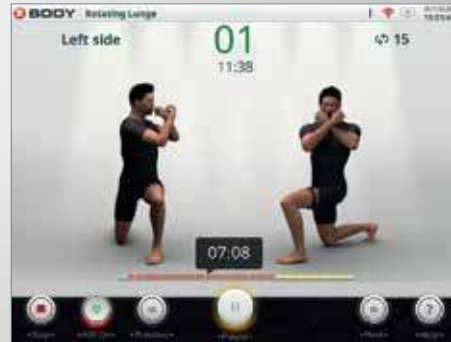
With the help of the virtual video trainer you can focus on your clients to correct their posture and change intensity of impulses, providing a better more effective training experience.