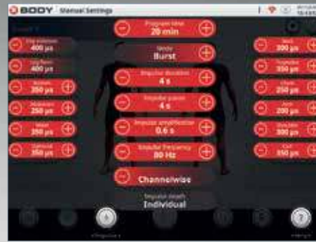
You can set up the impulse depth individually channelwise tailored per client.