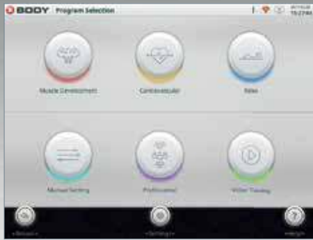
Professional mode, where you can set up the intensity in an individual way.